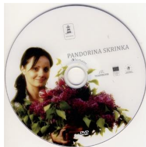
A 2.1 Film