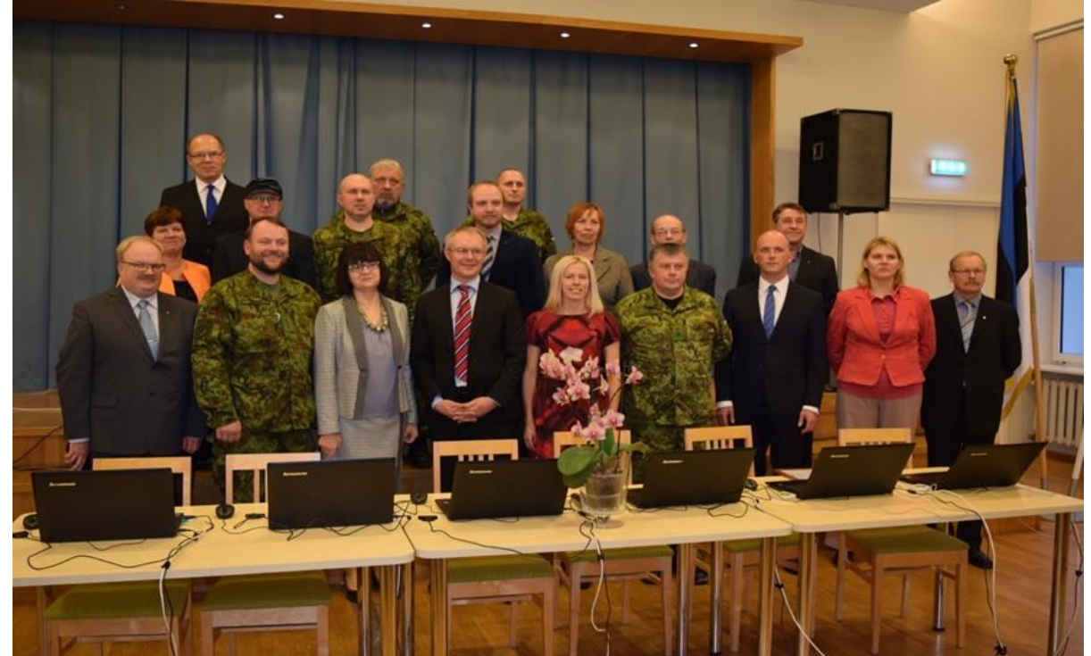
November 9, 2015 – key partners signed the cooperation agreement